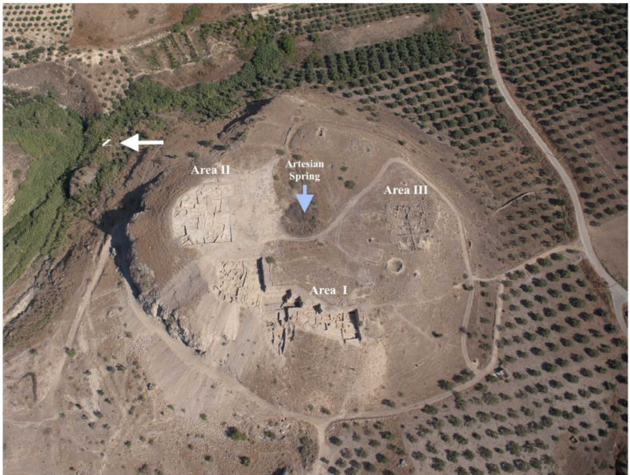
Fig. 0.4 Tall Zirā'a with location of Area I to III and the spring