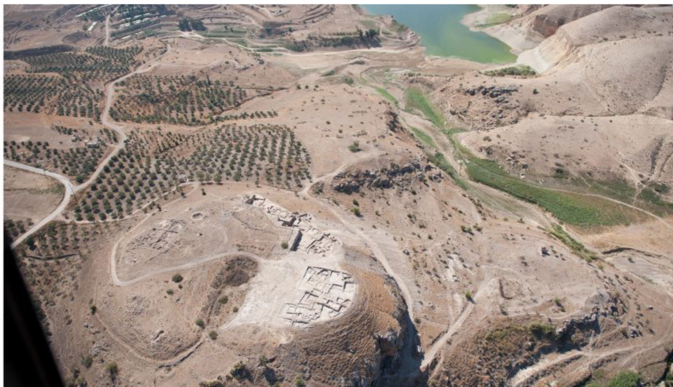
Fig. 0.1 Tall Zirā'a. View from west to east. Photograph taken in 2011.